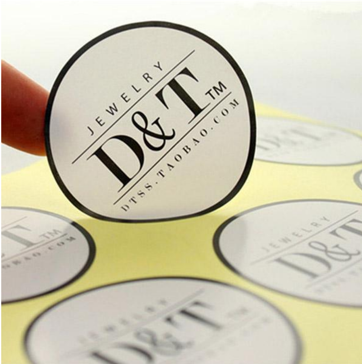
Sinst Printed Paper Labels Process